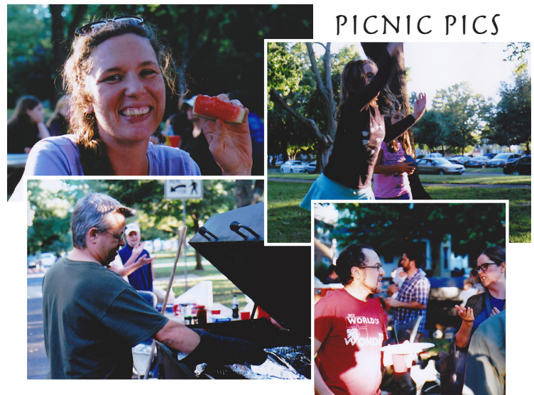
A good time was had by all at the Uplands annual picnic in September. Thanks to everyone who participated!